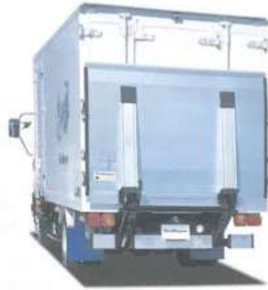
WASTE DISPOSAL ENCLOSED TRANSPORT VEHICLE (Sample)